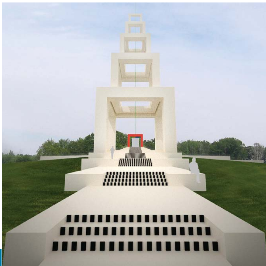
Figure 3: Daniel Burren's design (CGI) for the Ebbsfleet Landmark. © Daniel Burren, 2008.

Geographical definitions of place since the 1970s have focused on the combination of location (an objective, definable point in space) and meaning (Agnew, 1987; Tuan, 1977; Cresswell, 2004). Places are locations with meaning. This can be illustrated by the observation that Latitude 51° 30' 18" N, Longitude 0° 1' 9" W is a location but London Docklands is a place. While they share the same objective position, London Docklands is a place that includes Canary Wharf, a Docklands museum, office blocks, smart restaurants and a hi-tech light rail line. The Docklands also has a past. It was a place associated with the docks, with slavery, with a working class population and with centuries of immigration. Outside the museum, very little of this past is apparent. As well as being a location, then, place has a physical landscape (buildings, parks, infrastructures of transport and communication, signs, memorials, etc.) and, crucially, a 'sense of place'. Sense of place refers to the meanings, both individual and shared, that are associated with a place. While this combination of location, landscape and meaning is perhaps obvious in a settlement, it is less obvious in relation to places at smaller scales. But even a favourite chair has a particular location (in front of the fireplace perhaps), a physical structure (worn armrests, wobbly legs) and meanings (maybe it is where your dad sat when reading stories to you as a child). Places are not necessarily fixed in space. A